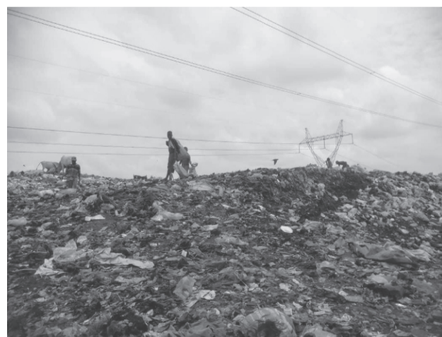
Illegal dumping site at Ifesowapo Omiyale CDA

"We can't win a war against water by building high flood defences in individual houses but we can control its effect by creating its own passage for free flow without excessive disruption during rainy season," he said.