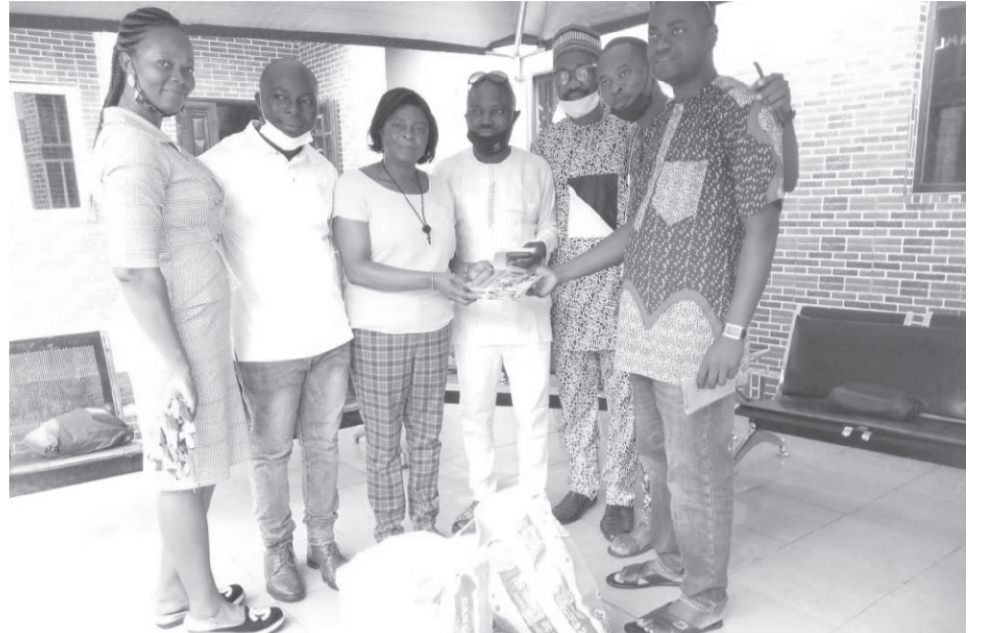
EHS 2000 at Compassionate Orphanage Home

While encouraging the government to do more, she appealed to individual philanthropists in the society to also render support for the living of the orphans.