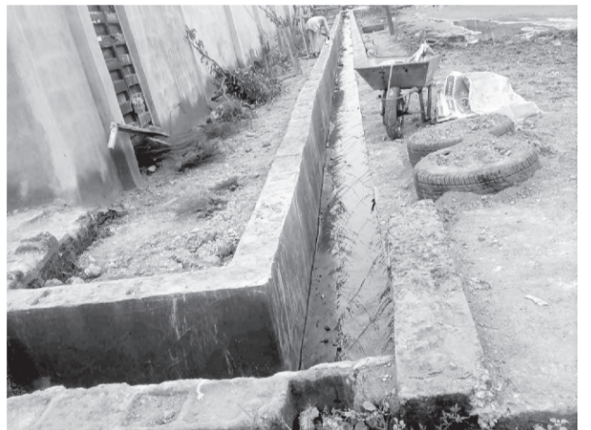
Constucted drainage at Adams Street

collective effort of the community would inspire the local council authority to render them the needed support on other projects.