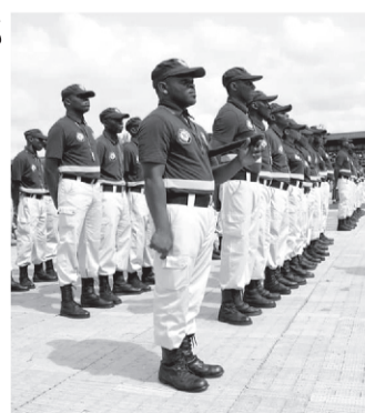
Men of the LNSC

He explained that the security agent would be assisting the police to maintain orderliness and keep the peace of the communities.